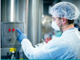
Safety and quality Food