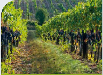
Agriculture & sustainable livestock