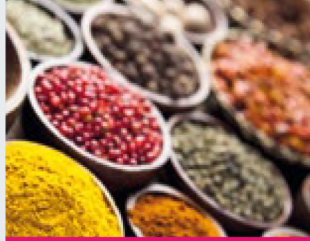
Ingredients & raw materials