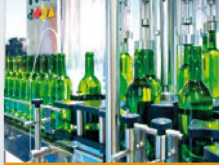
Food & beverage processing