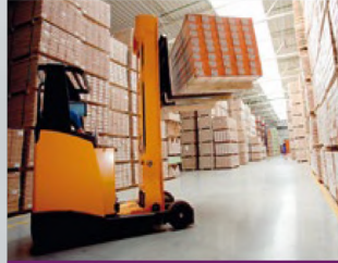
Logistics and transport